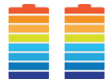
2 "C-Cell" batteries included in handle to boost LED output