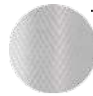
Textured metal handles for maximum control and handling