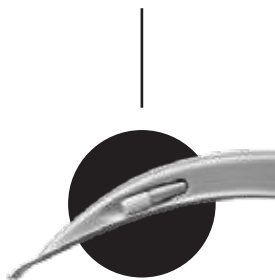
Brightest LED laryngoscope in the market